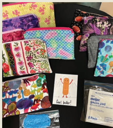
Park Church members created and assembled nearly 200 wound kits for unhoused Cherry Health patients receiving behavioral health services.

Through our partnership with Cherry Health over the years, we have found the work they do and the services they provide for our community to be invaluable. They are continually identifying what is needed in our community and implementing a plan to meet that need.